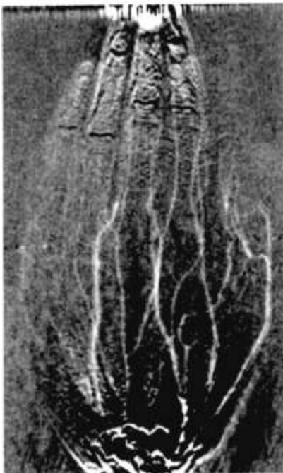
FIG. 3. Difference image produced from images in Fig. 2 shows cancellation of stationary tissue, leaving blood vessels. (Eddy current effects produce slight registration artifacts at the ends of the field.)

The technique reported here differs from those above in that in addition to modifying the conventional imaging sequence to control the sensitivity to flow, taking the difference of two images (or two signals) acquired with different flow sensitivity permits canceling out stationary tissues and imaging only vessels. Computer simulations of a similar technique were presented in (17). Cardiac