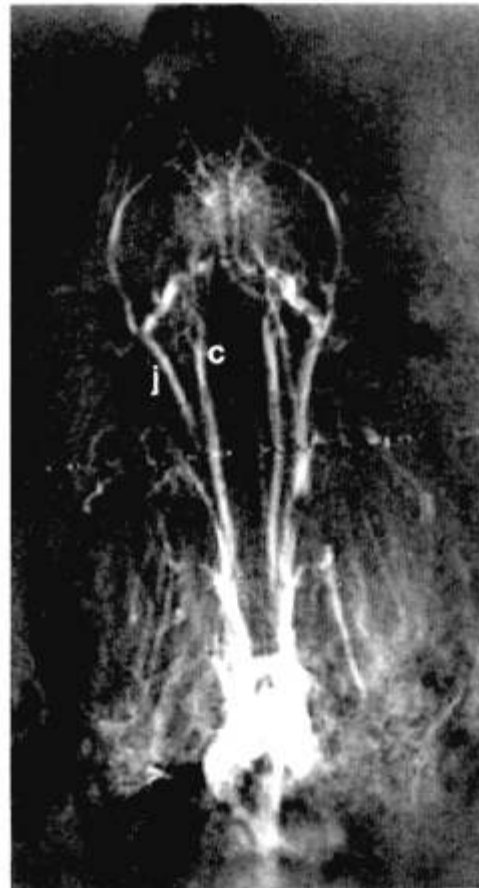
FIG. 4. Projection image of head and thorax of rat obtained with same pulse sequence as in Fig. 3 (with smaller field of view). Note that both arteries and veins are seen, for example, the carotids (c) and jugulars (j).

gating is unnecessary and veins can be imaged as well as arteries. By acquiring the velocity-compensated and -uncompensated data in an interleaved manner, registration errors due to subject motion are minimized.